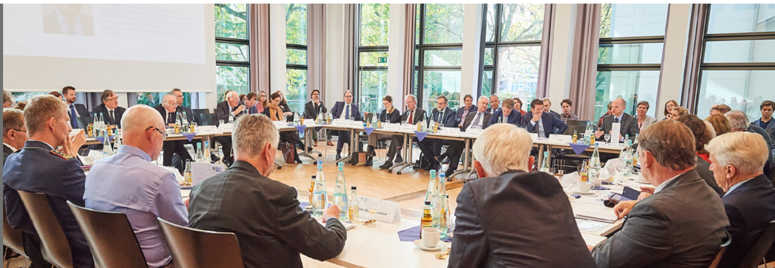
The 2017 Bonn Security Forum in progress

Skeptics proposed, however, that continued over-dependence on U.S. engagement might prove to be the current system's fatal weakness. A lack of American support in rhetoric and practice for liberal multilateralism could strengthen those opponents of the tenets of the liberal world order who prefer an international structure marked by unilateralism and competition for influence in a multipolar world. The time available for safeguarding the current global order might be limited and the current state of uncertainty a mere calm before the storm, forcing those countries that benefit the most from a rules-based liberal system, among those Germany, to swiftly adjust their international engagement to a transforming environment. The international community has, in fact, experienced an unprecedented series of challenges in recent years, from the Ukraine crisis to escalating tensions in North Korea or the ongoing humanitarian and security crisis in Syria. Perhaps the current state of the liberal world order could best be likened to a cracked windshield in a moving car: while the resilience of the glass is a testament to the quality of its design, one major blow to its structure could suffice to cause a disaster.