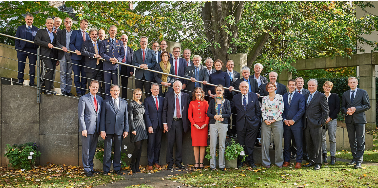
Participants of the 2017 Security Forum

NATO. Other proposals on NATO burdensharing proved to be more controversial. Above all, the Wales Summit agreement on the 2 percent defense spending target remains a point of contention between Europe and the U.S. While Americans underlined that the call for higher European defense spending is near-ubiquitous among U.S. policymakers, Europeans suggested that the American leadership should perhaps adopt a more differentiated understanding of defense spending, including funds spent on development and nation building.