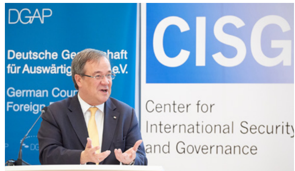
Minister-President Armin Laschet opening the conference