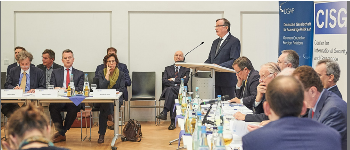
Impressions from the Forum

A related issue is a familiar tension between national and European interests and politics that decision-makers inevitably face. While public support for greater European cooperation on security suggests that voters would likely support policy advances, spending for costly investments needed to enhance capabilities will clash with other domestic priorities. Budget reallocations are most likely to be far less popular measures, particularly in times of social and economic uncertainty, and European politicians are likely to fear losing voter support over substantial defense budget increases. As such, there is a risk that the current boom in talk of European defense and security could remain a mostly rhetorical phenomenon. A failure to build on existing support for joint European security mechanisms, however, could spark further disillusionment with European affairs and trigger a major loss of political capital.