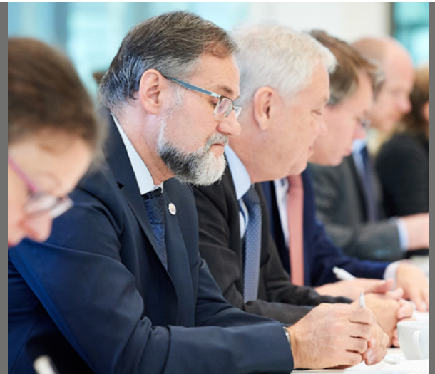
Wolfgang Rudischhauser, Vice President of the Federal Academy for Security Policy

Related to this notion is the experts' repeated call for Europe and Germany, in particular, to make itself an indispensable partner for the U.S. in the maintenance of regional and international security. Making Germany indispensable would require not only substantial increases in engagement and investments in hard capabilities, but also a more creative and flexible European approach to the transatlantic partnership. To make U.S. policymakers recognize the benefits of maintaining and strengthening the transatlantic partnership in foreign and security affairs, decision-makers in Europe ought to present their counterparts in the U.S. with proposals and initiatives that will catch their attention and bring them back to the discussion table, one participant proposed.